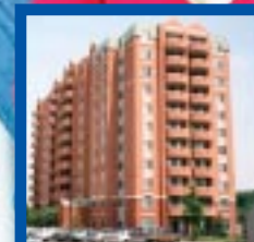
Apartments & condos